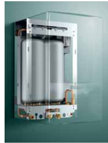
ecoTEC plus 937